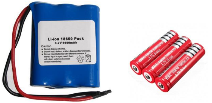
Figure 2 - Example of Lithium Ion Cells and Batteries

Lithium-ion batteries (sometimes abbreviated Li-ion batteries) are a secondary (rechargeable) battery where the lithium is only present in an ionic form in the electrolyte. Also included within the category of lithium-ion batteries are lithium polymer batteries. Lithium-ion batteries are generally used to power devices such as mobile telephones, laptop computers, tablets, power tools and e-bikes.