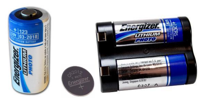
Figure 1 - Example of Lithium Metal Cells and Batteries

Lithium-ion batteries (sometimes abbreviated Li-ion batteries) are a secondary (rechargeable) battery where the lithium is only present in an ionic form in the electrolyte. Also included within the category of lithium-ion batteries are lithium polymer batteries. Lithium-ion batteries are generally used to power devices such as mobile telephones, laptop computers, tablets, power tools and e-bikes.